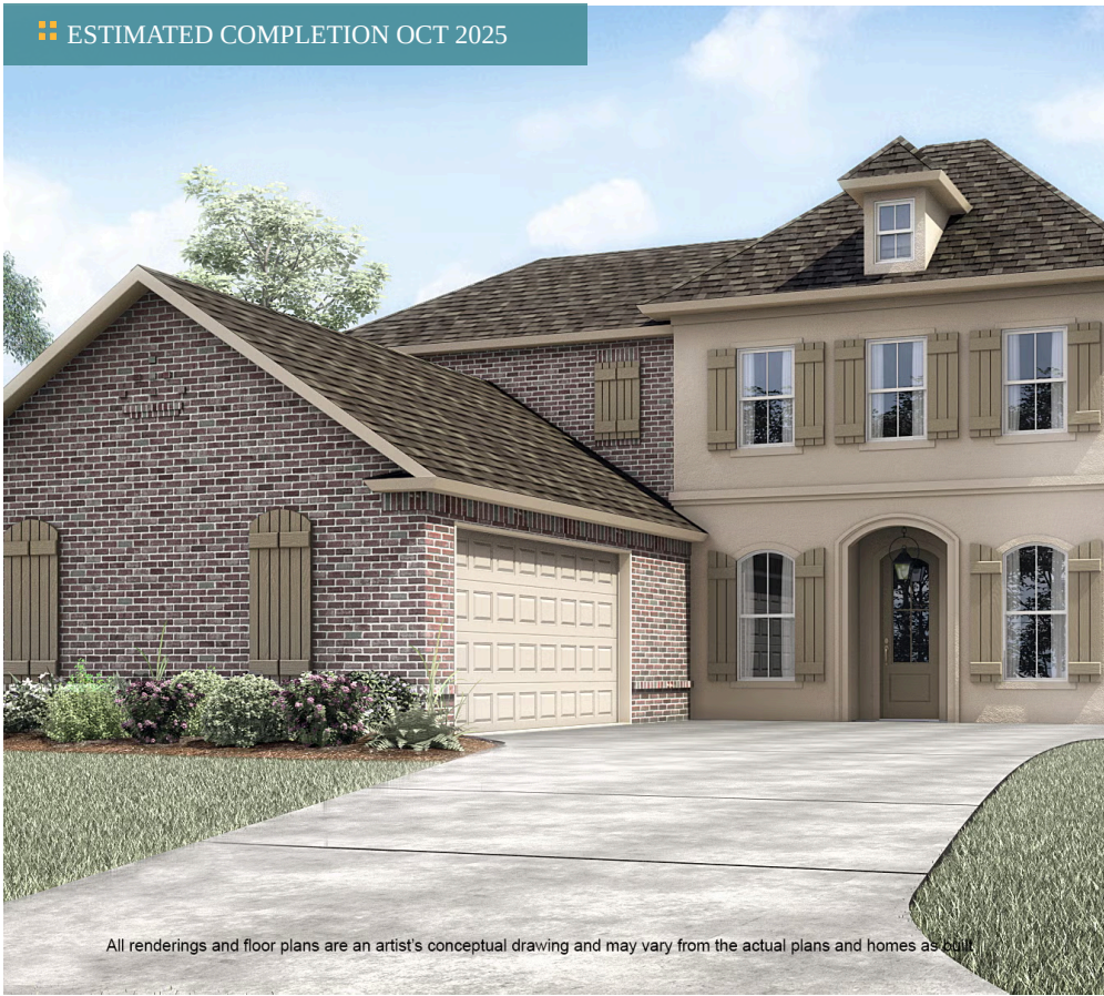
All renderings and floor plans are an artist's conceptual drawing and may vary from the actual plans and homes as built.